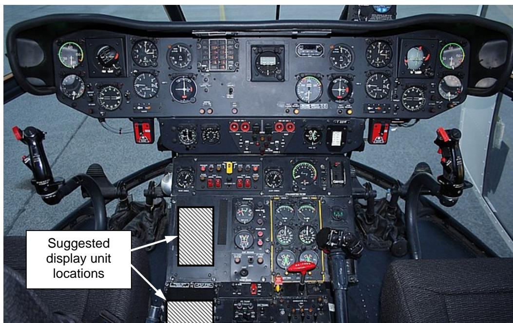
Figure 2. Suggested locations of display unit

Select an appropriate vacant space in the cockpit for the installation of the Indigo display unit. The Indigo One cradle supplied with the kit fits in a standard 6.25” avionics rack. Figure 2 provides possible installation locations.