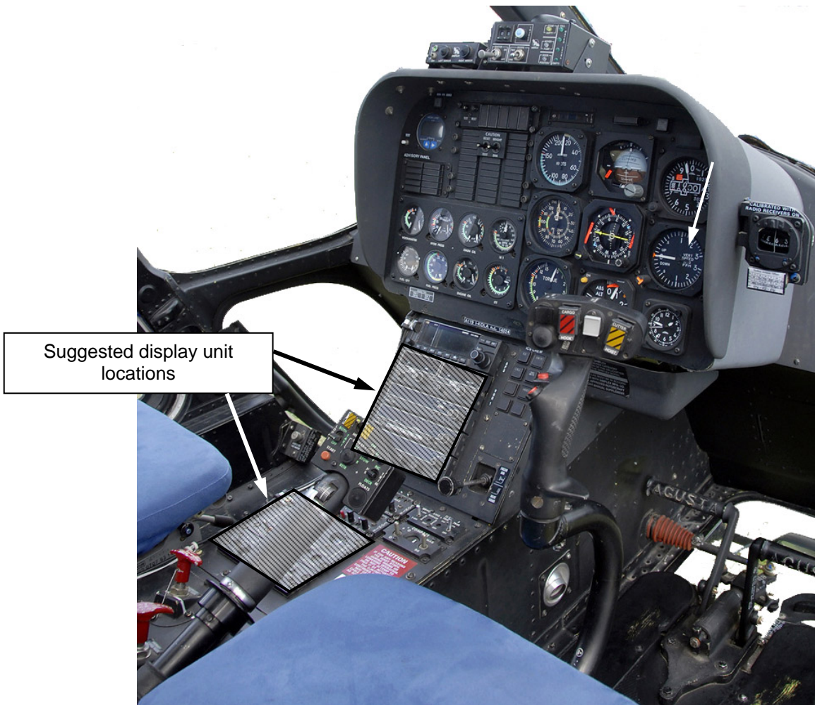
Figure 2. Suggested locations of display unit

Select an appropriate vacant space in the cockpit for the installation of the Indigo display unit. The Indigo One cradle supplied with the kit fits in a standard 6.25” avionics rack. Figure 2 provides possible installation locations.