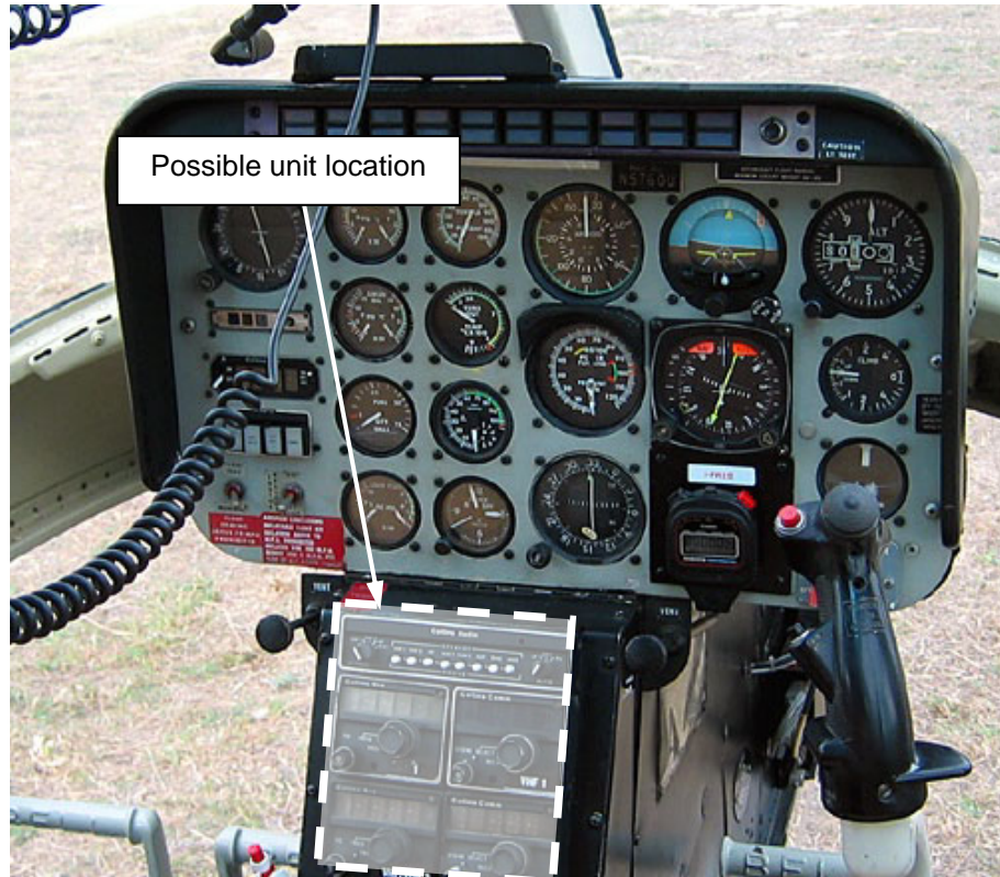
Figure 2. Possible location of Indigo One display unit.

Select an appropriate vacant space in the cockpit for the installation of the Indigo display unit. The Indigo One cradle supplied with the kit fits in a standard 6.25” avionics rack. Figure 2 shows a possible location for the installation of the display unit.