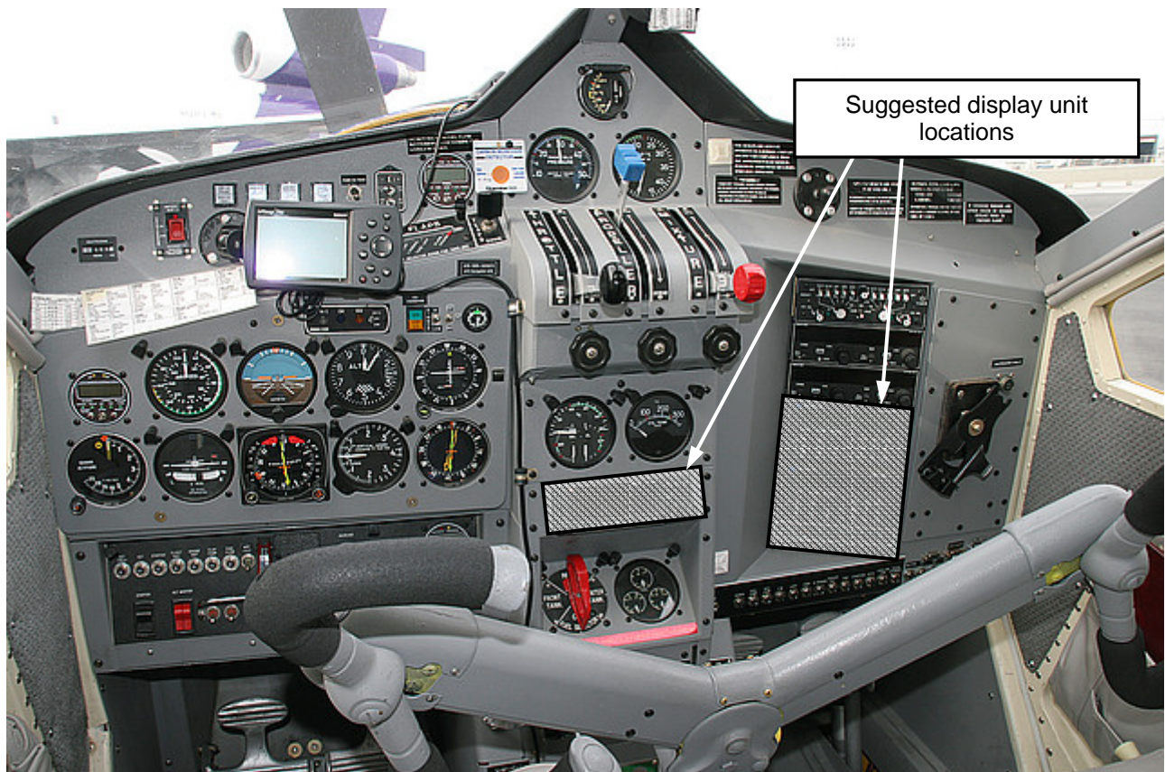
Figure 2. Suggested locations of display unit

There are several possible positions for location of the Indigo One control unit on the flight deck of the DHC-2. The operator or installer may be in the best position to specify where they wish it located based on available space, operational considerations and ease of access for installation. Depending on position chosen and availability of existing avionic rack structure, additional support structure to hold the cradle may be necessary. No pilot access to the unit is required for proper operation of the tracking system.