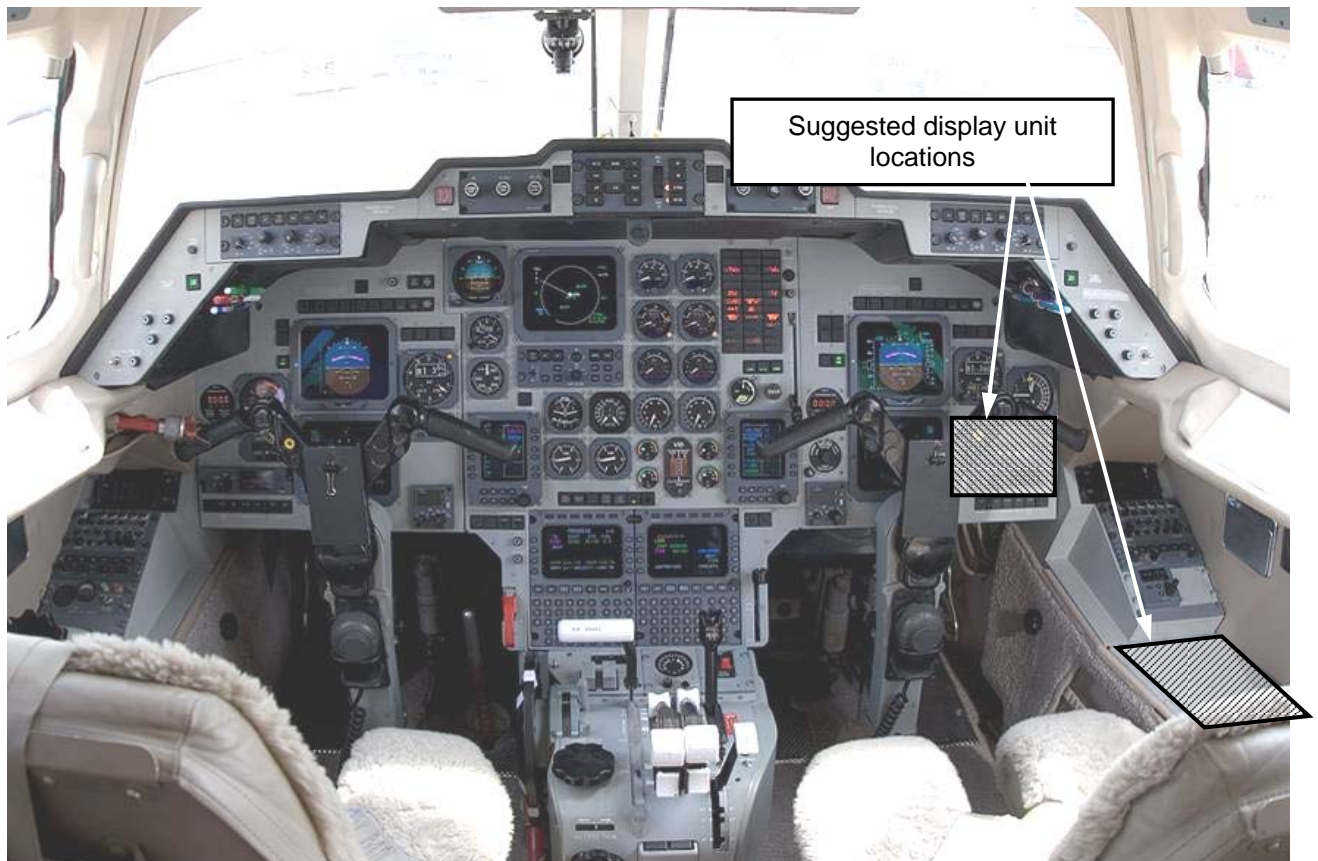
Figure 2. Suggested locations of display unit

If no suitable position is achievable in the instrument panel, then the unit may be installed to the side panels / roof of the cabin or behind the pilot's seat. No pilot access to the unit is required for proper operation of the tracking system.