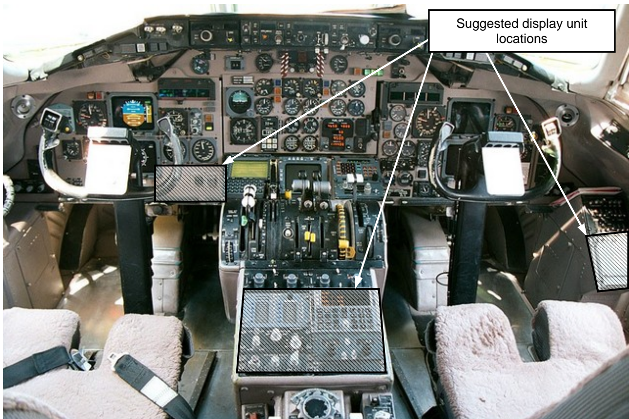
Figure 3. Suggested locations of display unit

There are several possible positions for location of the Indigo One control unit on the flight deck of the MD-80. Possibilities are the instrument panel, side consoles (pilot or co-pilot side) or centre pedestal. The operator or installer may be in the best position to specify where they wish it located based on available space, operational considerations and ease of access for installation. Depending on position chosen and availability of existing avionic rack structure, additional support structure to hold the cradle may be necessary. No pilot access to the unit is required for proper operation of the tracking system.