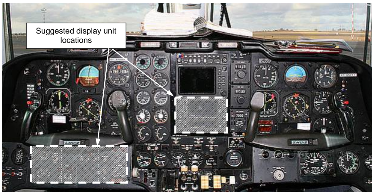
Figure 2. Suggested locations of display unit

If no suitable position is achievable in the instrument panel, then the unit may be installed to the side panels / roof of the cabin or behind the pilot's seat. No pilot access to the unit is required for proper operation of the tracking system.